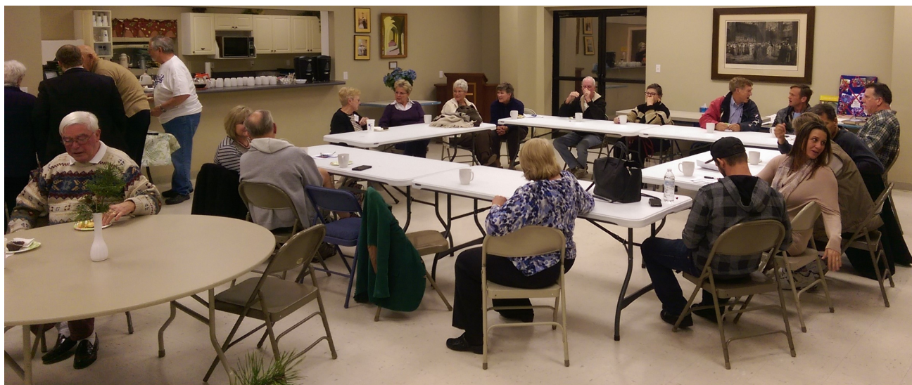
About 50 people came to the 12-step Gratitude Holy Eucharist we held on November 24, including the Bishop.